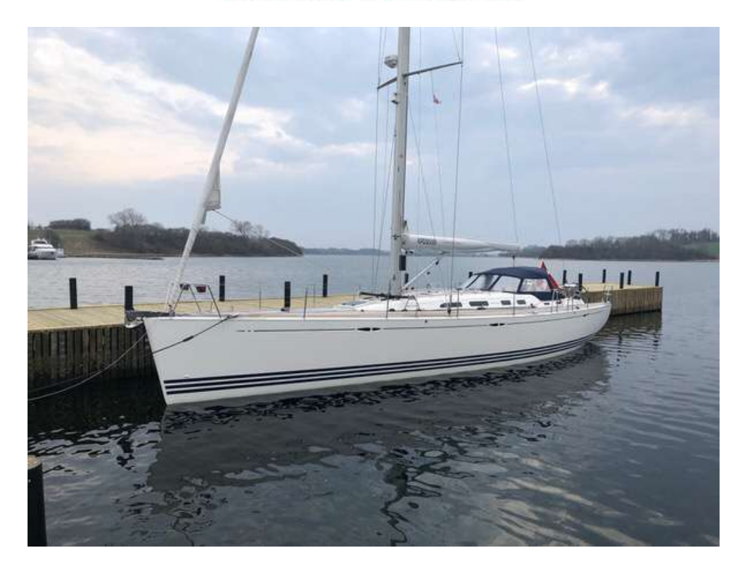
X 50 "n° 53" - Ref: 15136

This X 50 has only one owner and has been professionally maintained over the years. She offers 3 ample double cabins, easy handling and very easy controllable sailing performance. Her impressive equipment of extras includes inverter, generator, water maker, oversized electrical winches, a furler-boom and even a heater.