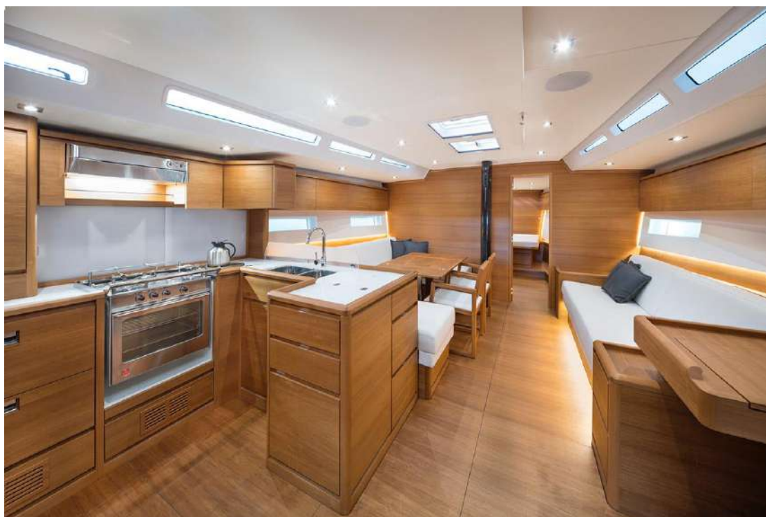
Interiors in Burma Teak